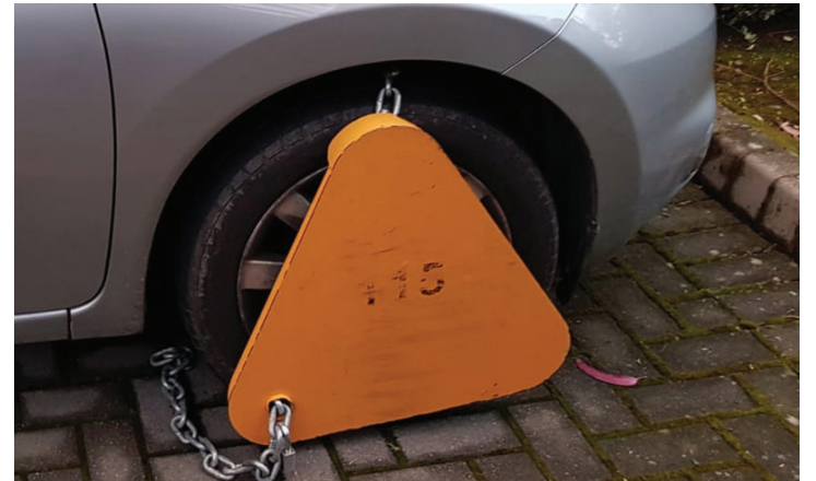
One of the cars that was clamped at Riversdale last week

In a statement to Wicklow Times , NCPs said "Some cars were clamped in error and they were released free-of-charge. We apologise for any inconvenience caused."