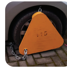
MISTAKEN CLAMPING page 12

NORTH EDITION DELIVERED TO HOMES & BUSINESSES IN: SHANKILL, ENNISKERRY, BRAY, GREYSTONES, DELGANY, KILCOOLE, NEWCASTLE, KILQUADE, ASHFORD, KILPEDDER, NEWTOWNMOUNTKENNEDY, KILMACANOGUE, LARAGH, MONEYSTOWN, ROUNDWOOD.