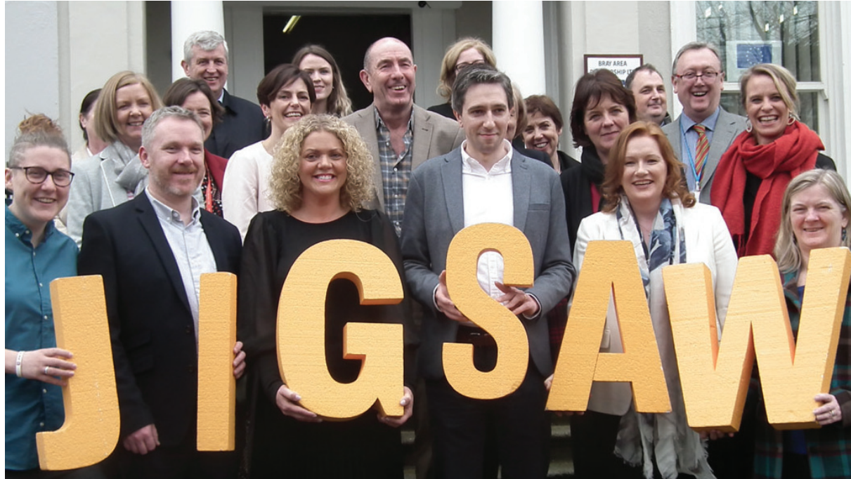
Minister Simon Harris outside Bray Area Partnership for the announcement of the Jigsaw service for Co. Wicklow, with representatives from the Bray Area Partnership, the HSE, Children and Young People Services Committee, Be Well Bray, Youthreach, Cairdeas Clubhouse, Child and Adolescent Mental Health Services (CAMHS), and St. John of God.

Local stakeholders gathered in Bray on Friday to meet Minister Simon Harris and representatives from Jigsaw and hear the much anticipated news regarding a new service for Co. Wicklow. The meeting provided Minister Harris and Jigsaw with the opportunity to confirm that Bray has been selected to be the site of the next Jigsaw Youth Mental Health Project.