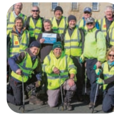
PURE CLEANUP page 8