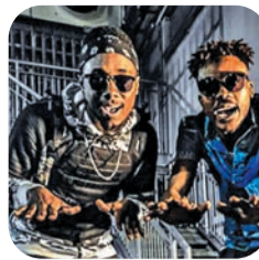
BRAY SIDE page 2