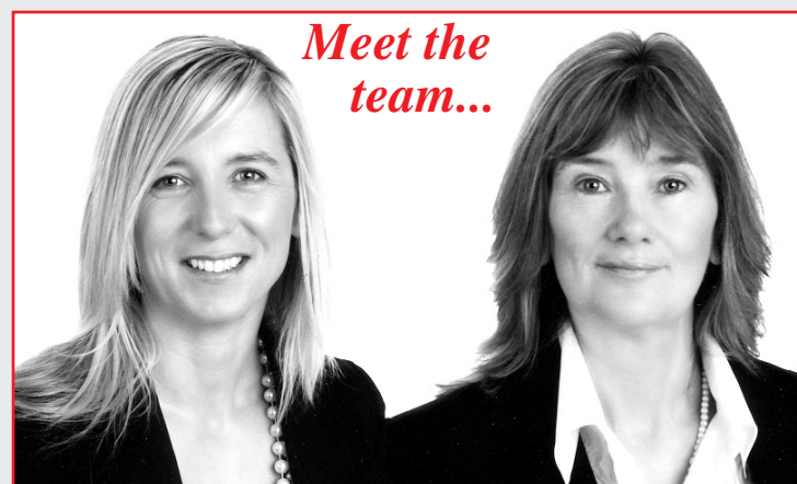
Meet the team...