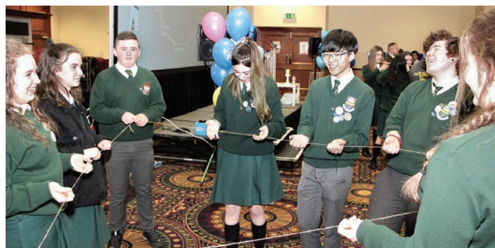
Students from St Killian's Community School, Bray at the Young SVP East Region Youth Day 2019

One of the mothers who attends the group urged bereaved parents to give it a try. "When I met other parents the sheer isolation lifted. For the first time I understood that what I was experiencing was normal".