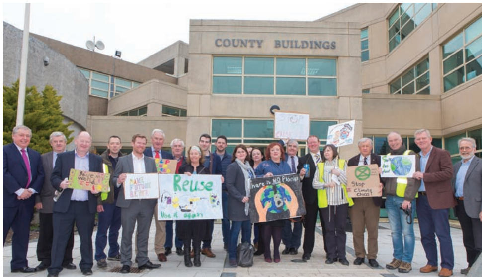
Councillors and candidates outside County Buildings showing support for action on climate change

that Wicklow "will immediately implement the following steps (as leading proactive cities and regions internationally already have): declare a climate emergency for Wicklow; publish a climate action plan; declare a biodiversity emergency for Wicklow; update and publish a biodiversity action plan; report regularly on progress on both action plans; that county Wicklow and each of the five Wicklow municipal districts will join the global covenant of mayors for climate and energy".