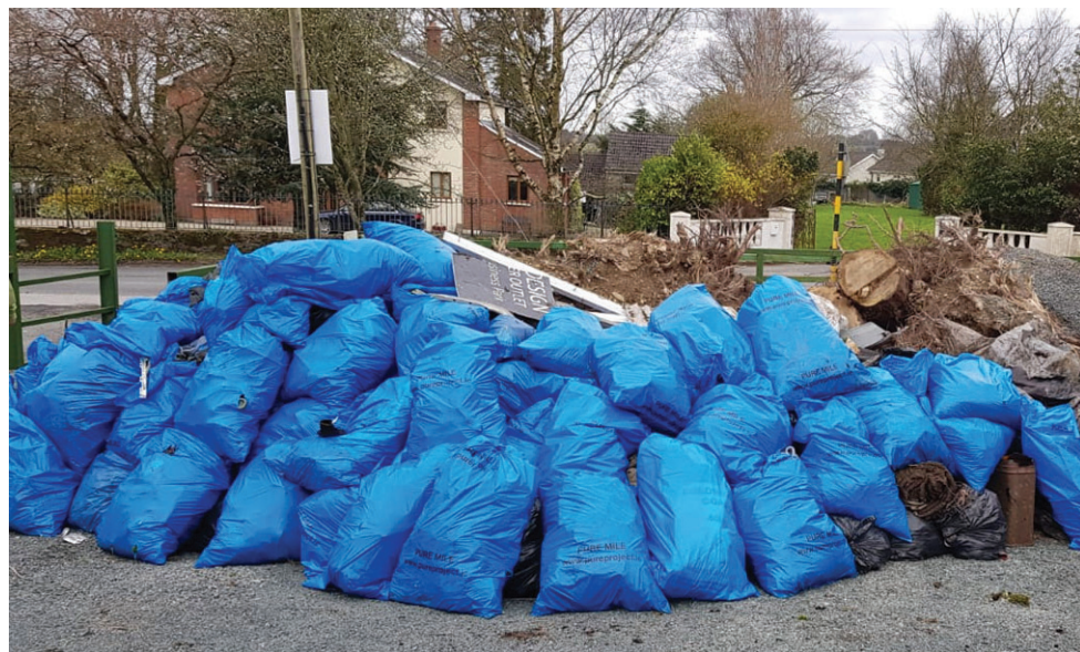
Rubbish collected recently by the Dunlavin Pure Mile group during a cleanup.