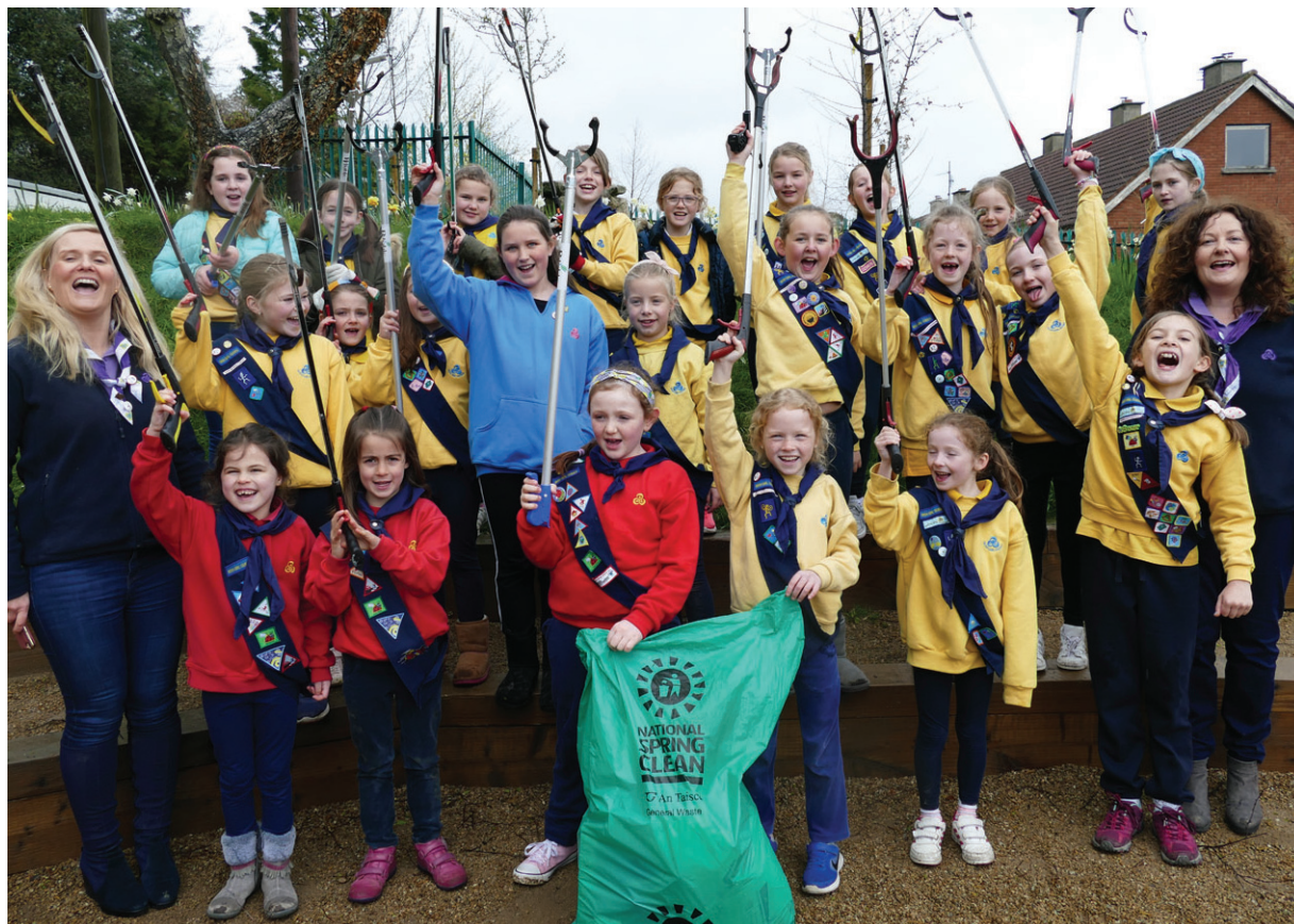
Members of Irish Girl Guides from Greystones and Delgany were thrilled to feature on RTE's News2day programme when they did a litter pick in the grounds of St Laurence's National School in Greystones. The Ladybirds, Brownies and Guides decided to join the An Taisce Spring Clean as one of their good turns for Irish Girl Guides' National Good Turn Week.