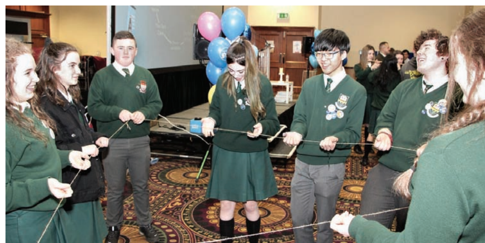
Students from St Killian's Community School, Bray at the Young SVP East Region Youth Day 2019

One of the mothers who attends the group urged bereaved parents to give it a try. "When I met other parents the sheer isolation lifted. For the first time I understood that what I was experiencing was normal".