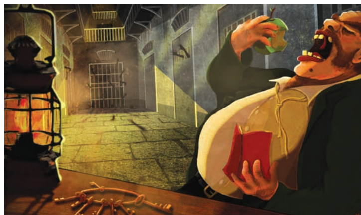
The 'Gates of Hell' virtual reality experience at Wicklow Gaol