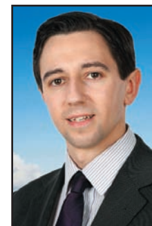
Minister Simon Harris

Minister Harris continued "The scheme, which is open to new entrants, will be advertised locally and applications for funding will be invited by our