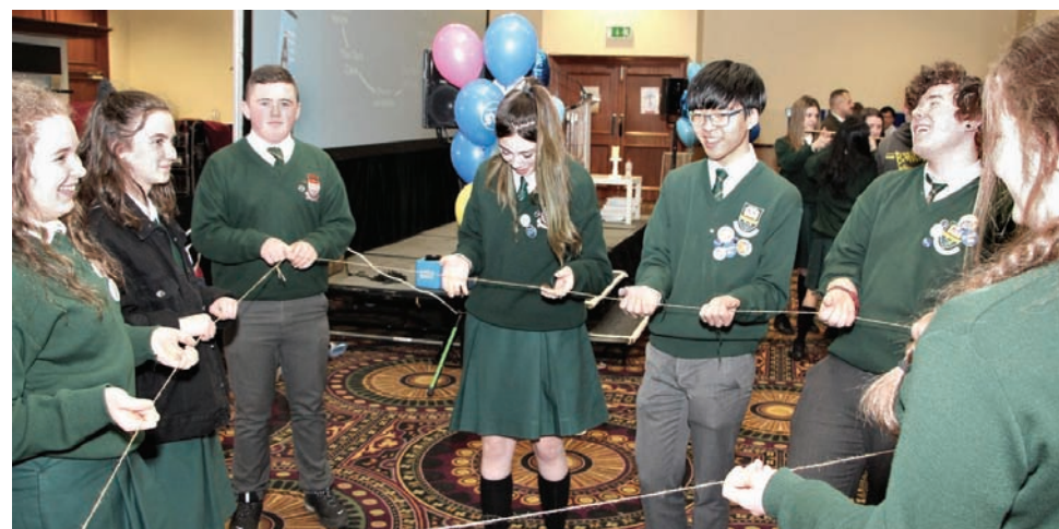
Students from St Killian's Community School, Bray at the Young SVP East Region Youth Day 2019

One of the mothers who attends the group urged bereaved parents to give it a try. "When I met other parents the sheer isolation lifted. For the first time I understood that what I was experiencing was normal".