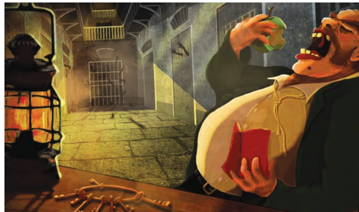
The 'Gates of Hell' virtual reality experience at Wicklow Gaol