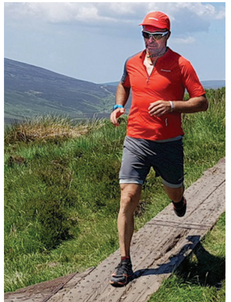
The Ecotrail running event will take participants through some of Wicklow's most scenic locations

Running is one of the fastest-growing sports in the world, and Wicklow is a fantastic addition to our destinations. Having seen the beauty of Wicklow late last year, Ecotrail Wicklow might just become one of our most popular events."