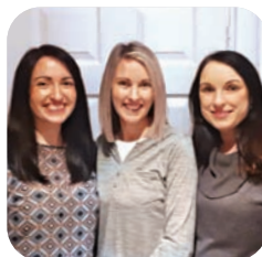
ORGAN DONOR AWARENESS page 6