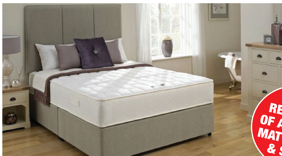
KING KOIL POSTURE GUARD 5FT BED. SHOW MODEL. WAS €1595 NOW €795