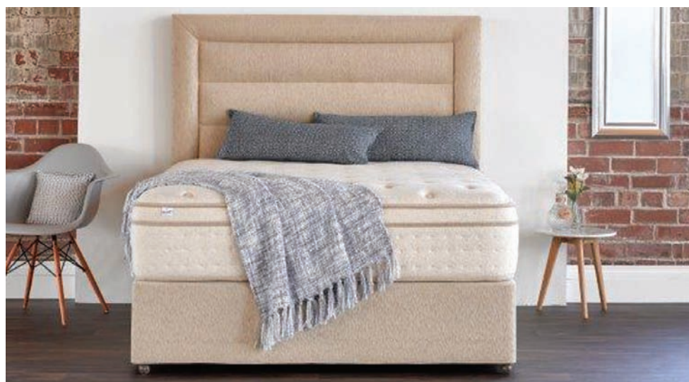
RESPA ECSTASY 4FT6 MATTRESS & INSPIRE BASE. WAS €1895 NOW €1695