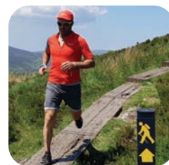
ECOTRAIL page 14

NORTH EDITION DELIVERED TO HOMES & BUSINESSES IN: SHANKILL, ENNISKERRY, BRAY, GREYSTONES, DELGANY, KILCOOLE, NEWCASTLE, KILQUADE, ASHFORD, KILPEDDER, NEWTOWNMOUNTKENNEDY, KILMACANOGUE, LARAGH, MONEYSTOWN, ROUNDWOOD.