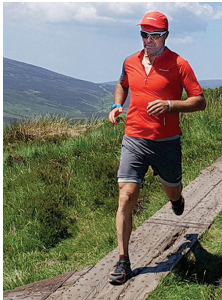
The Ecotrail running event will take participants through some of Wicklow's most scenic locations

Running is one of the fastest-growing sports in the world, and Wicklow is a fantastic addition to our destinations. Having seen the beauty of Wicklow late last year, Ecotrail Wicklow might just become one of our most popular events."