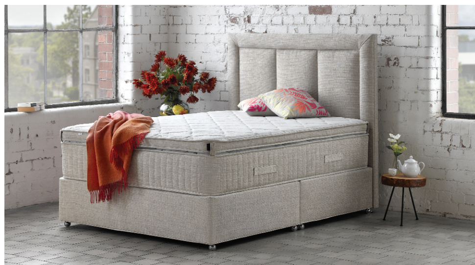
RESPA SOLACE SUPPORT 5FT MATTRESS & LIFESTYLE BASE. WAS €1995 NOW €1795