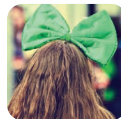
ST. PATRICK'S DAY pages 10 & 11

NORTH EDITION DELIVERED TO HOMES & BUSINESSES IN: SHANKILL, ENNISKERRY, BRAY, GREYSTONES, DELGANY, KILCOOLE, NEWCASTLE, KILQUADE, ASHFORD, KILPEDDER, NEWTOWNMOUNTKENNEDY, KILMACANOGUE, LARAGH, MONEYSTOWN, ROUNDWOOD.