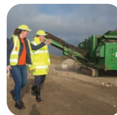
MARRAKESH page 8