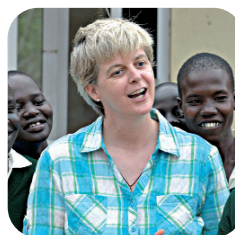
NUN SO BRAVE page 3