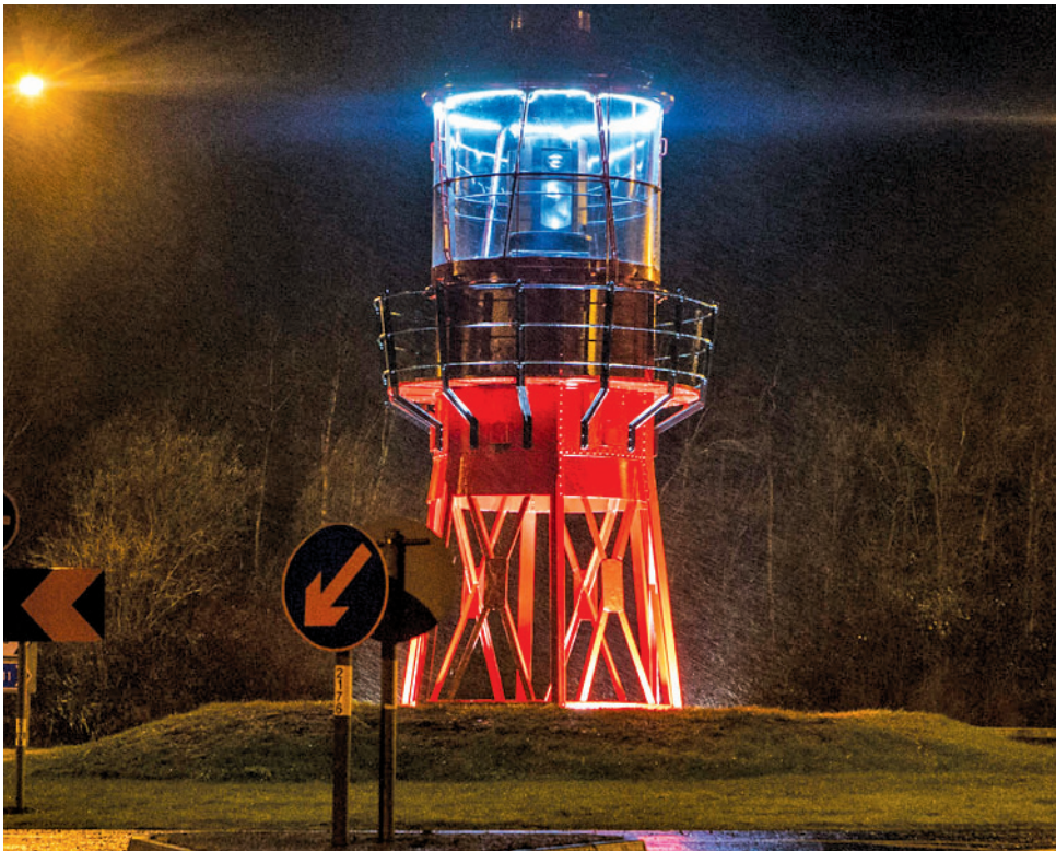
The illuminated lightship lantern at the roundabout at Junction 20 leading into Arklow

"A special thanks to the Arklow Tidy Towns who have maintained some of the roundabouts over the years. I also wish to acknowledge the work undertaken by the staff of Arklow Municipal District who introduced the scheme and the engineering staff who have worked with contractors and overseen the works on each roundabout."