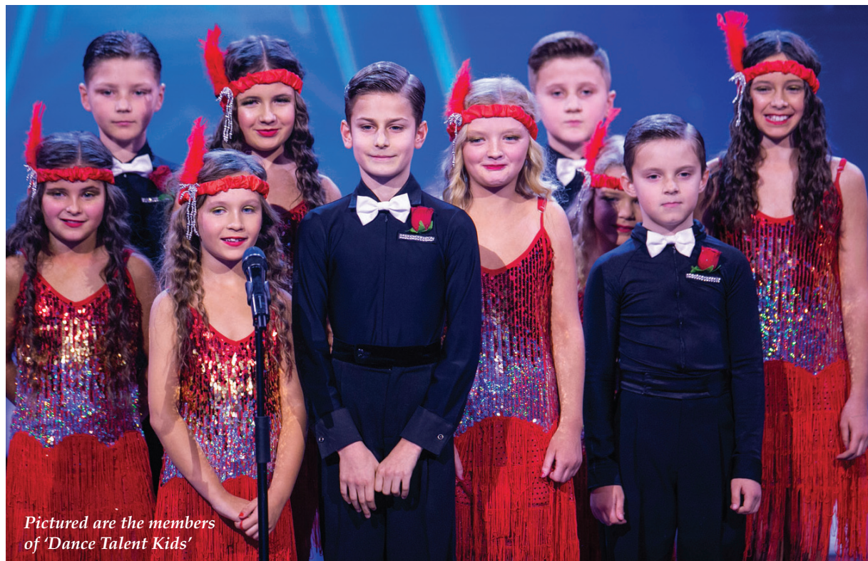
Pictured are the members of 'Dance Talent Kids'