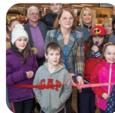
RATHNEW POST OFFICE page 12