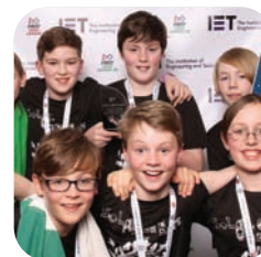
BUDDING ENGINEERS page 17

SOUTH EDITION DELIVERED TO HOMES & BUSINESSES IN: RATHNEW, WICKLOW, GLENEALY, BRITTAS BAY, AVOCA, WOODENBRIDGE, ARKLOW, SHILLELAGH, TINAHELY, REDCROSS, BALLINACLASH, AUGHIRM, RATHDRUM, DONARD, DUNLAVIN, CARNEW, COOLATTIN, BALTINGLASS, BLESSINGTON.