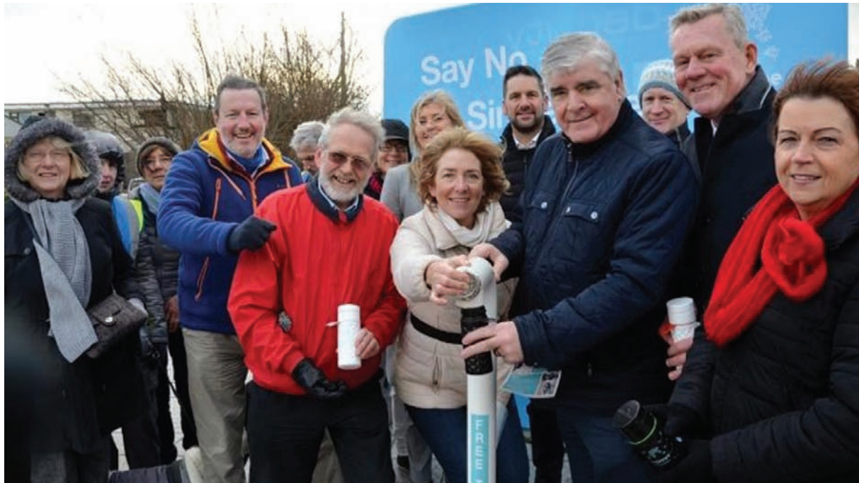
Greystones councillors and Tidy Towns members at the new water refill station next to the South Beach Playground.