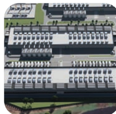
ARKLOW DATA CENTRE page 4