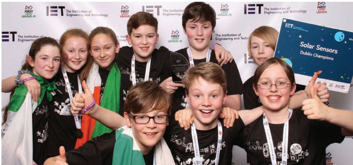
The winning team 'Solar Sensors' from Wicklow Montessori Primary School at the Institution of Engineering and Technology's (IET) FIRST LEGO League UK and Ireland final in Bristol.

The event, was the largest ever FIRST LEGO League UK and Ireland final with over 500 young people attending who were all keen to demonstrate their skills in robotics, computer programming, teamwork, research, problem solving and communication.