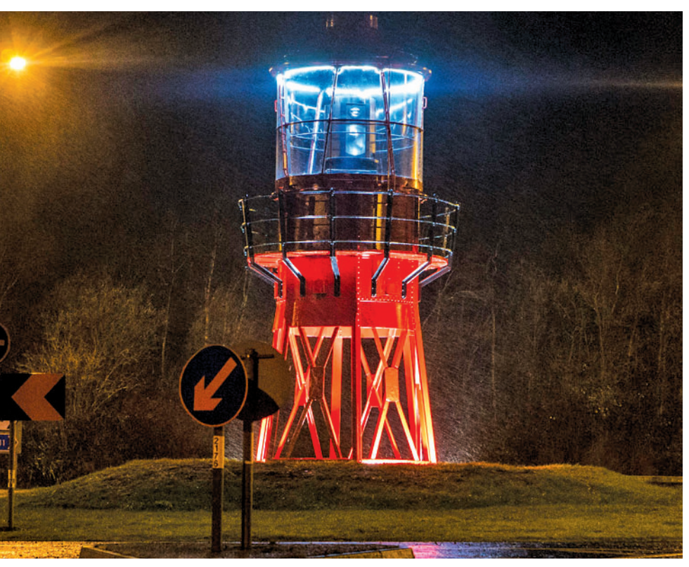
The illuminated lightship lantern at the roundabout at Junction 20 leading into Arklow

"A special thanks to the Arklow Tidy Towns who have maintained some of the roundabouts over the years. I also wish to acknowledge the work undertaken by the staff of Arklow Municipal District who introduced the scheme and the engineering staff who have worked with contractors and overseen the works on each roundabout.'