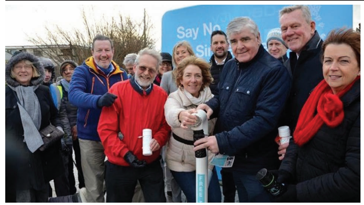
Greystones councillors and Tidy Towns members at the newwater refill station next to the South Beach Playground.