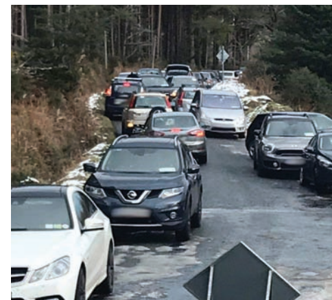
'Snow tourists descent on the Wicklow Uplands'

Over that weekend, Dublin & Wicklow Mountain Rescue Team and Glen of Imaal Mountain Rescue Team were tasked twice to rescue people from upland roads. On the afternoon of Wednesday, January 20th, and very early on Saturday morning, February 2nd