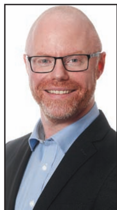
Stephen Donnelly, TD

According to the figures, the Community Healthcare East waiting