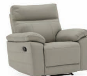
PALERMO 3+1 RECLINER (GREY) WAS €3045 NOW €1625 FOR SET