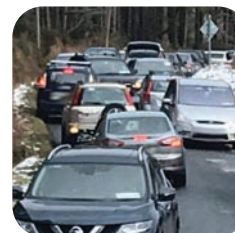
SNOW TOURISTS page 4