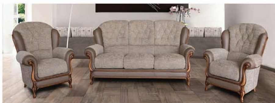
Corby 3-2-1 (montana plain coco/brushstrokes coco)

Selection of display models for IMMEDIATE delivery and FREE disposal of replaced sofas