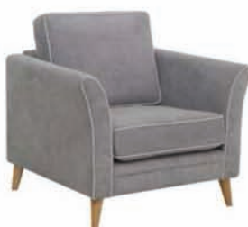
ISLA 2.5 - 2 - 1 (BETIS BEIGE) WAS €2485 NOW €1475 FOR SET