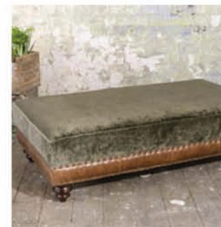
CONSTABLE GRAND SOFA, MIDI SOFA, WING CHAIR, LOUNGE STOOL WAS €9770 NOW 6450 FOR SET

Southern Cross Retail Park Bray Co. Wicklow