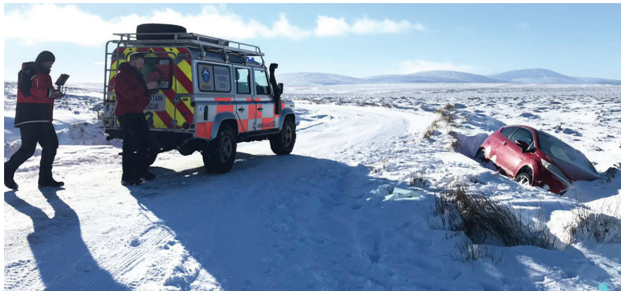
The Dublin-Wicklow Mountain Rescue Team comes to the aid of a motorist in the Wicklow Mountains.

There were chaotic scenes over the weekend of 2nd-3rd February as hordes of 'snow tourists', wanting to take in the scenery or go tobogganing, descended on the Wicklow Mountains and upland areas and became stranded, putting a strain on the resources of mountain rescue teams.