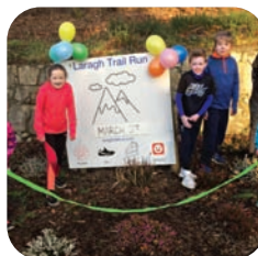
LARAGH TRAIL RUN page 2