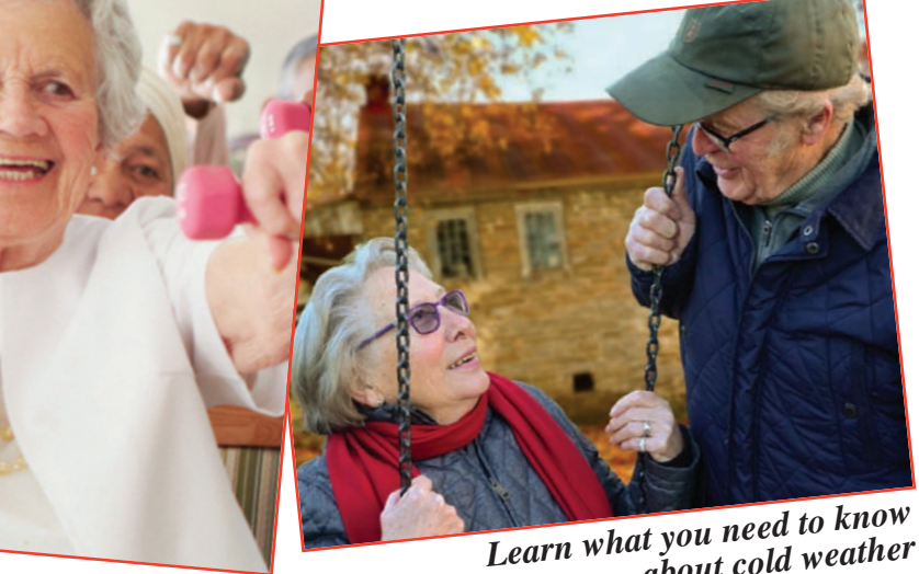
about cold weather