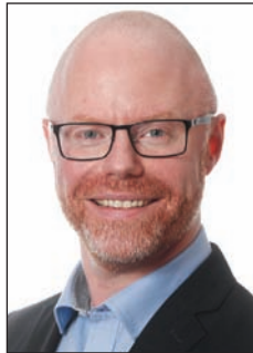
Stephen Donnelly, TD

Fianna Fail Deputy, Stephen Donnelly said