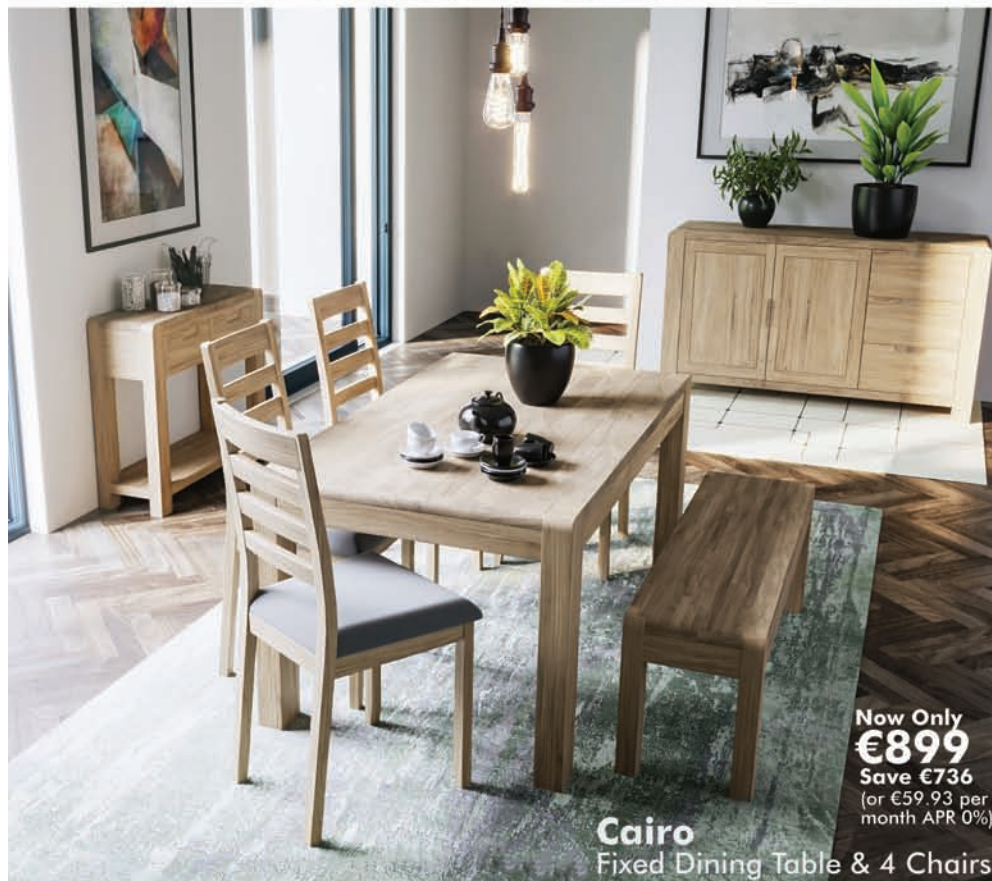
Cairo Fixed Dining Table & 4 Chairs

Now Only €899 Save €736 (or €59.93 per month APR 0%)