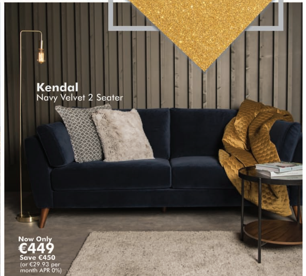
Kendal Navy Velvet 2 Seater

Now Only €899 Save €736 (or €59.93 per month APR 0%)