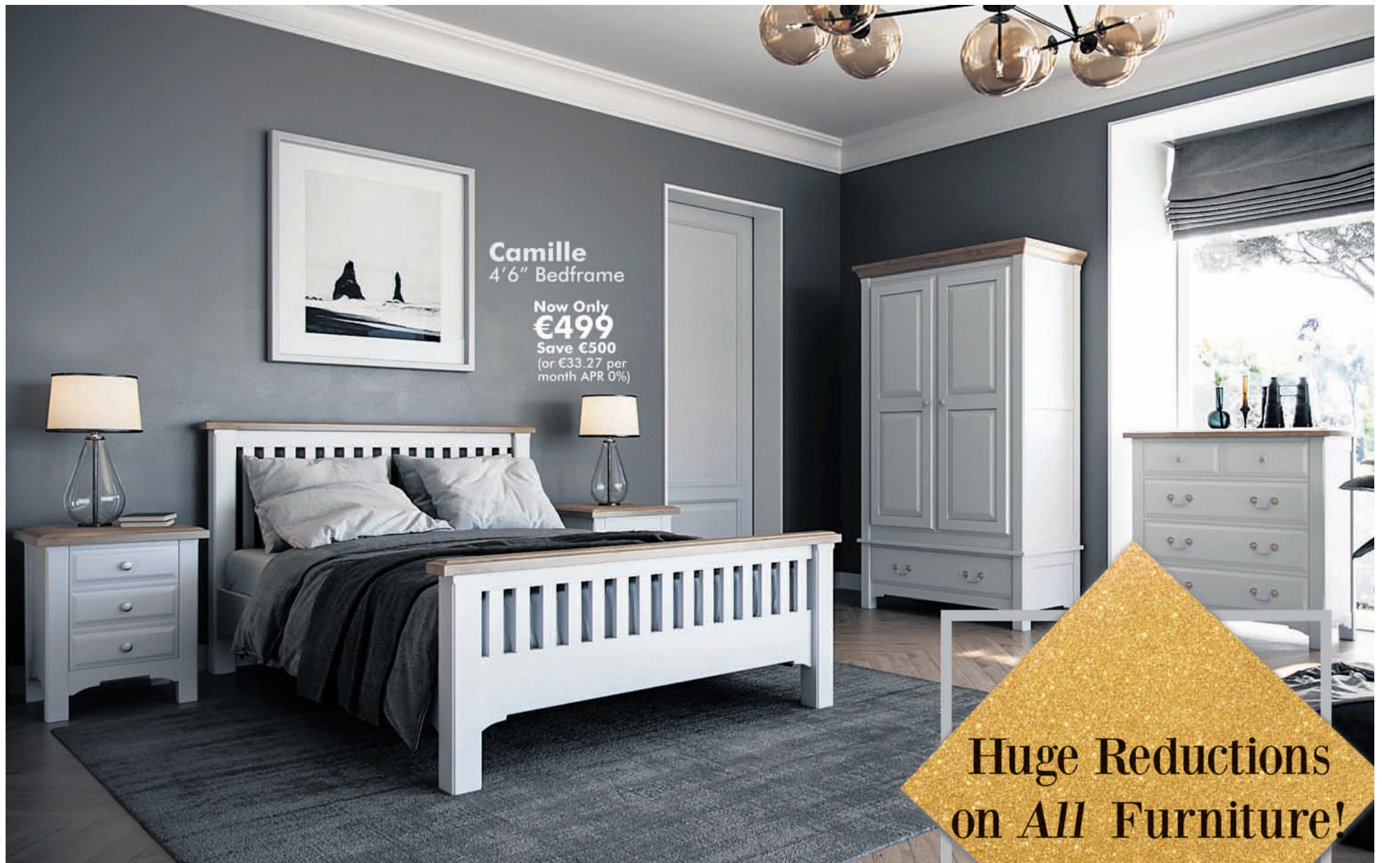
Camille 4'6" Bedframe

Now Only €499 Save €500 (or €33.27 per month APR 0%)