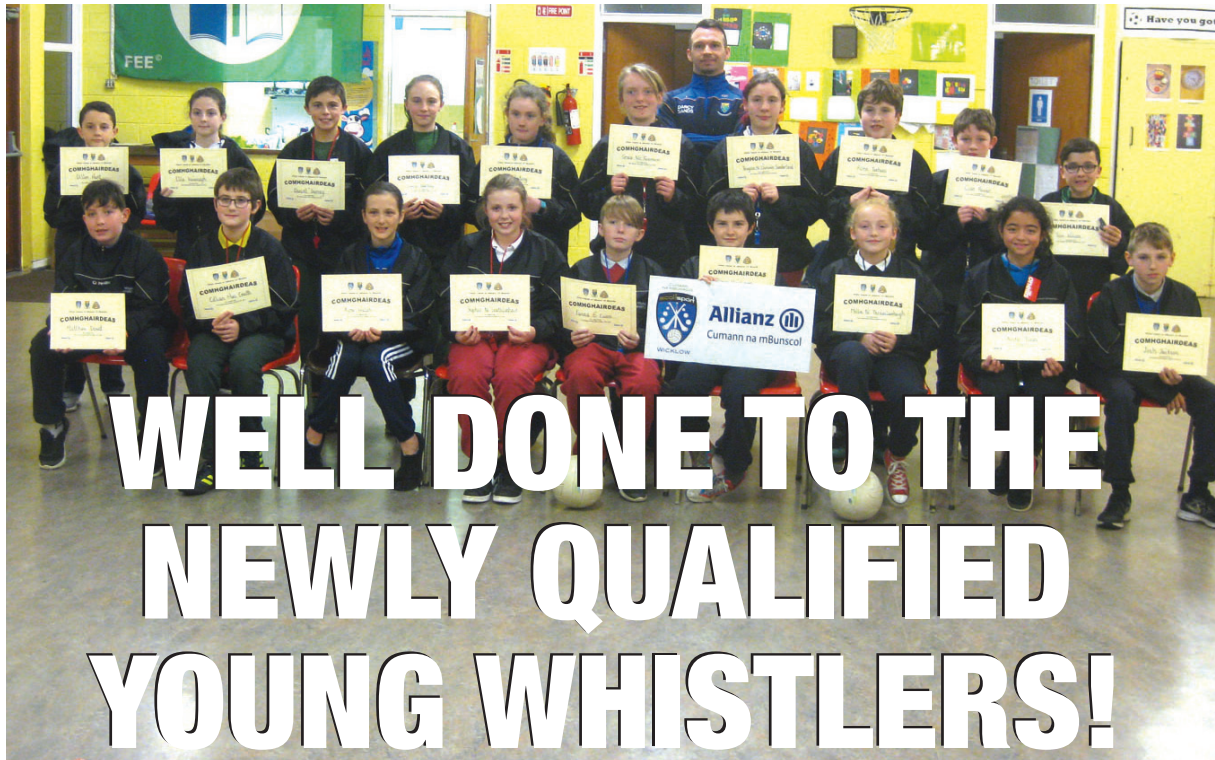
Cumann na mBunscol Chill Mhantáin held its now annual 'Young Whistlers' refereeing course recently in St. Brigid's Hall, Kilcoole Primary School.

Refereeing in the modern game can be a very daunting task however 19 determined 5th class boys and girls faced the challenge with great enthusiasm last Thursday.