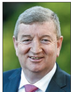
Pat Casey, TD

"The national crisis that is on all our minds for 2019 is Brexit,"